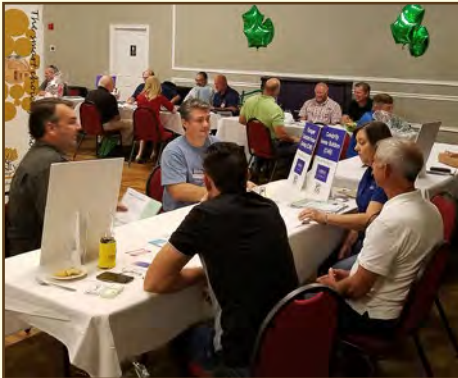
Meet the builder offered Associate members the opportunity to visit with decision makers of 15 building companies at New World Landing.