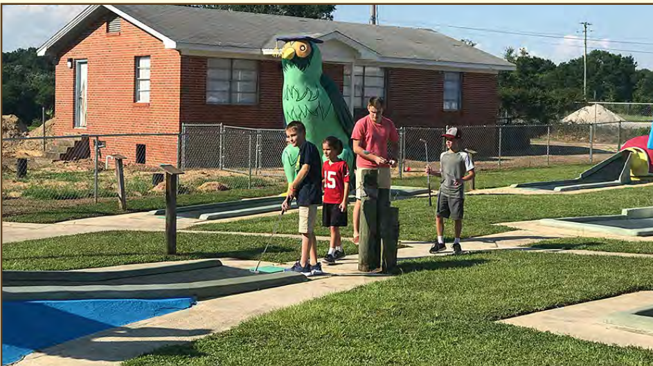
HBA members enjoyed a great day of Goofy Golf to celebrate the ending of a successful membership drive.