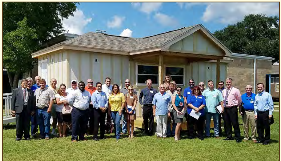
Leaders met at Pine Forest High School to support the construction trades program.