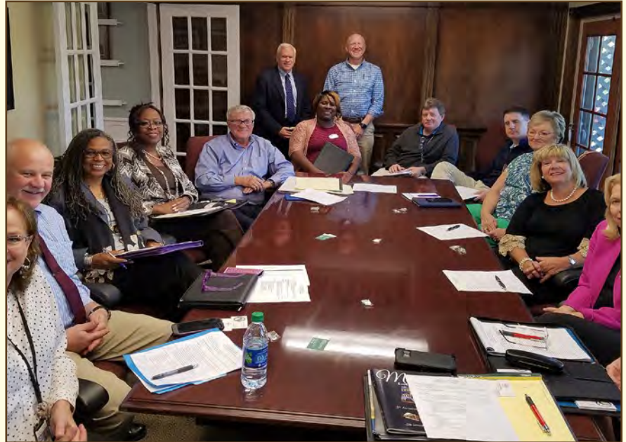
Partners came together to address the need for skilled brick masons on April 16th at the Home Builders Association of West Florida. A program is being developed to equip students with the skills necessary to find employment in the brick mason industry.