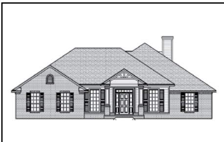
CATEGORY 7 - $272,900 - $275,000 Paragon Custom Home Group 5149 Wheeler Way Woodlyn Meadows