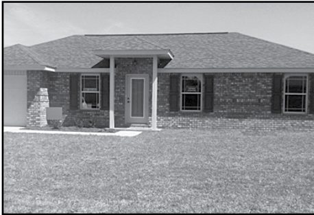
CATEGORY 1 - $117,290 - $150,000 Timberland Contractors 5604 Rosedown Court Plantation Woods