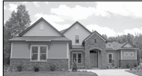
CATEGORY 14 - $645,000 - $696,000 Arthur Rutenberg Homes 6033 Huntington Creek Circle Huntington Creek