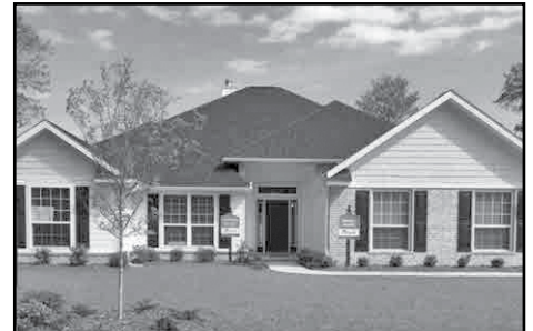
CATEGORY 6 - $242,071 - $265,900 Paragon Custom Home Group 6116 Stonechase Blvd. Stonechase