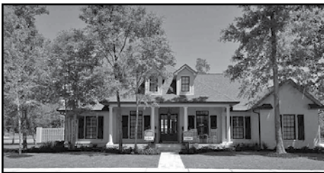
CATEGORY 13 - $549,000 - $594,720 K.W. Homes 8083 Foxtail Loop Nature Trail