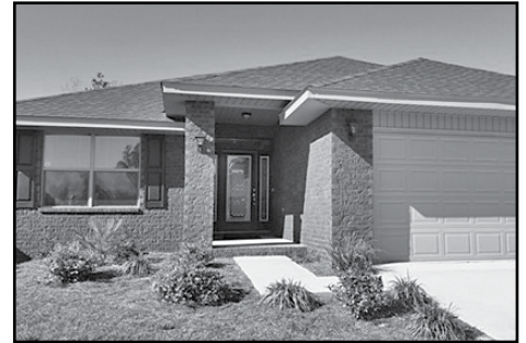
CATEGORY 3 - $170,556 - $190,350 Adams Homes 3464 Wasatch Range Loop Rd. Logan Place