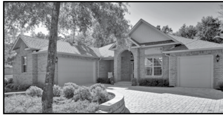
CATEGORY 11 - $414,990 - $449,999 Holiday Builders 8935 Foxtail Loop Nature Trail