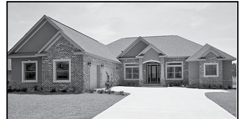
CATEGORY 12 - $479,999 - $530,000 Avant-Price Builders Group 7175 Australian St. Holly by the Sea