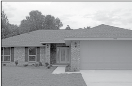
CATEGORY 4 - $195,300 - $216,350 Adams Homes 1993 Larkspur Circle Summerfield