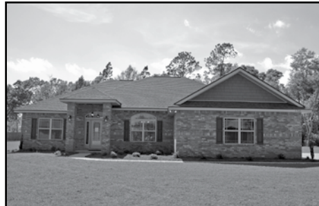
CATEGORY 5 - $219,900 - $238,290 Timberland Contractors 5760 Heatherton Rd. Cottonwood