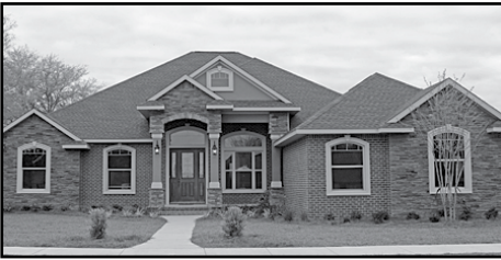
CATEGORY 10 - $368,806 - $399,900 Classic Homes of Pensacola 6021 Huntington Creek Blvd. Huntington Creek

The Parade of Homes was a tremendous success and the HBA would like to thank all the members who made it possible. Congratulations to the Outstanding Home Award Winners.