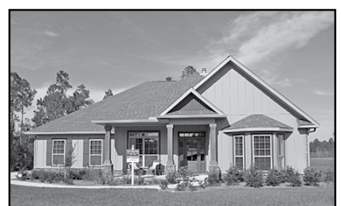
CATEGORY 9 - $321,500 - $350,000 D R Horton 2581 Tulip Hill Rd. Ashley Plantation