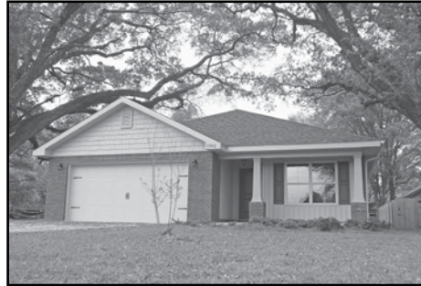
CATEGORY 2 - $150,100 - $167,900 Mitchell Homes 10542 Millbrook Dr. Betmark Circle