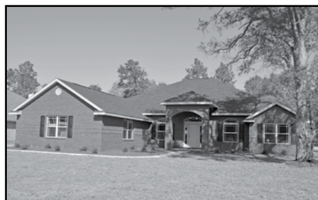
CATEGORY 8 - $284,900 - $299,500 Timberland Contractors 6082 Brighton Lane Cottonwood